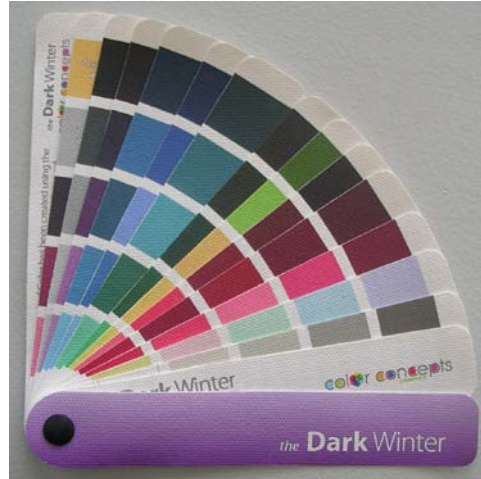
Women's Color Concepts Book

Click on images for purchase information