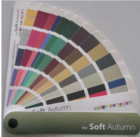
Men's Color Concepts Book